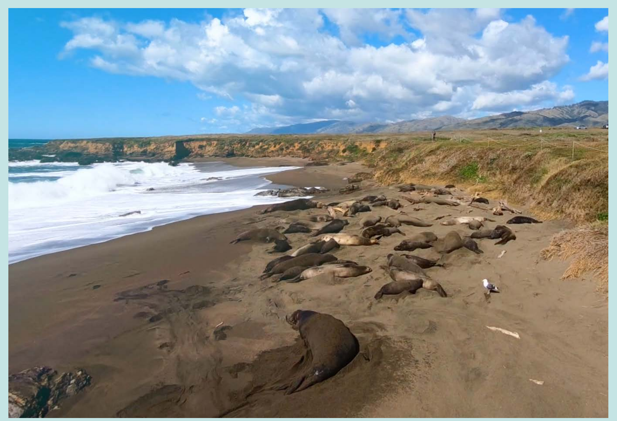
"Abundance of Wildlife" Video

From Zebras up north to Butterflies down south, there are so many species to be spotted on the Highway 1 Discovery Route.