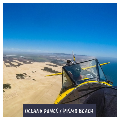
OCEANO DUNES / PISMO BEACH