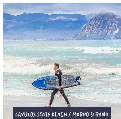
CAYUCOS STATE BEACH / MORRO STRAND