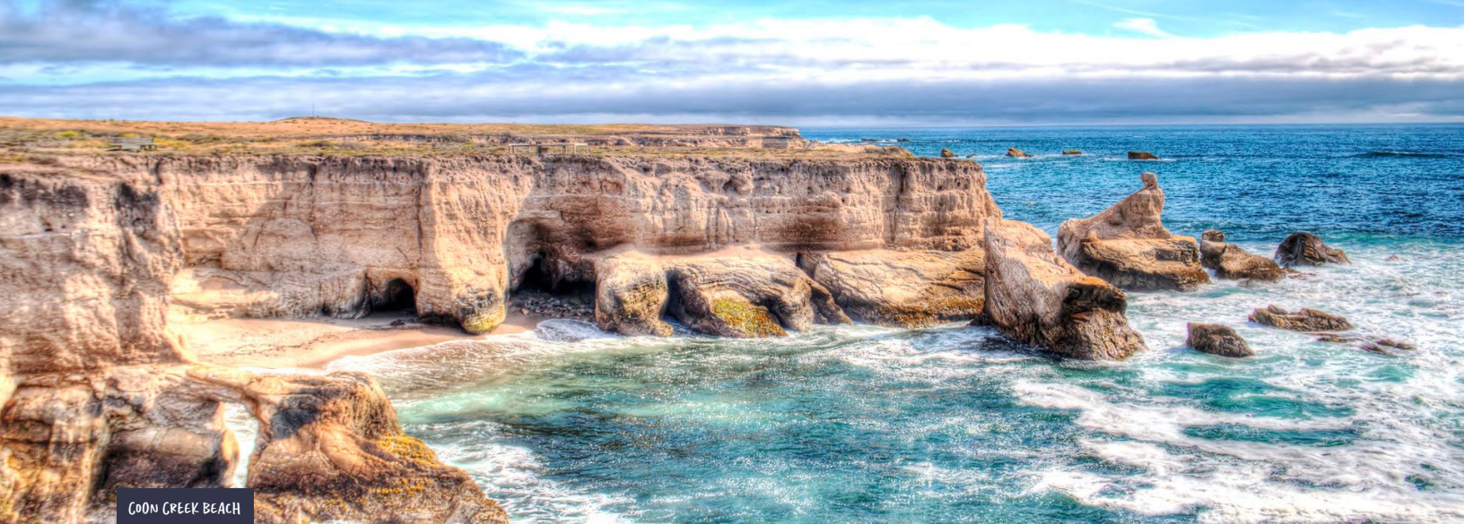
COON CREEK BEACH