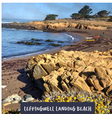
LEFFINGWELL LANDING BEACH

Parking, Restrooms, Sandy Beach, Path to Beach