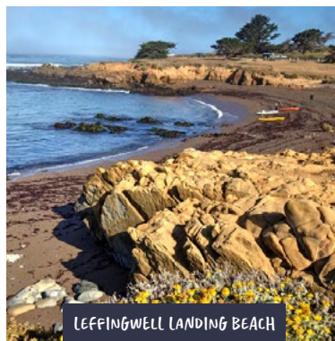
LEFFINGWELL LANDING BEACH

Parking, Restrooms, Sandy Beach, Path to Beach