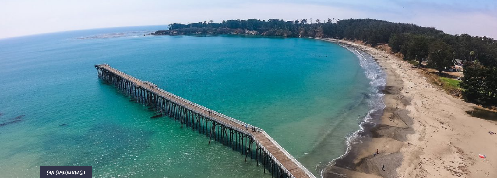
SAN SIMEON BEACH