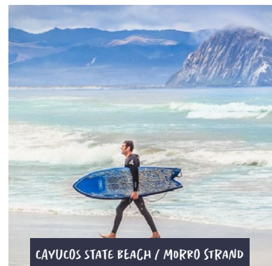
CAVUCOS STATE BEACH / MORRO STRAND